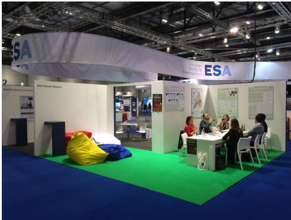
Picture 1: ESA Trainee Network Booth at London, during the Euroanaesthesia 2016