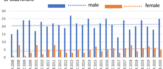
Lecturers during the obligatory board-certification preparation courses (three courses, A through C), gender distribution; x-axis: years, y-axis: absolute count of lecturers